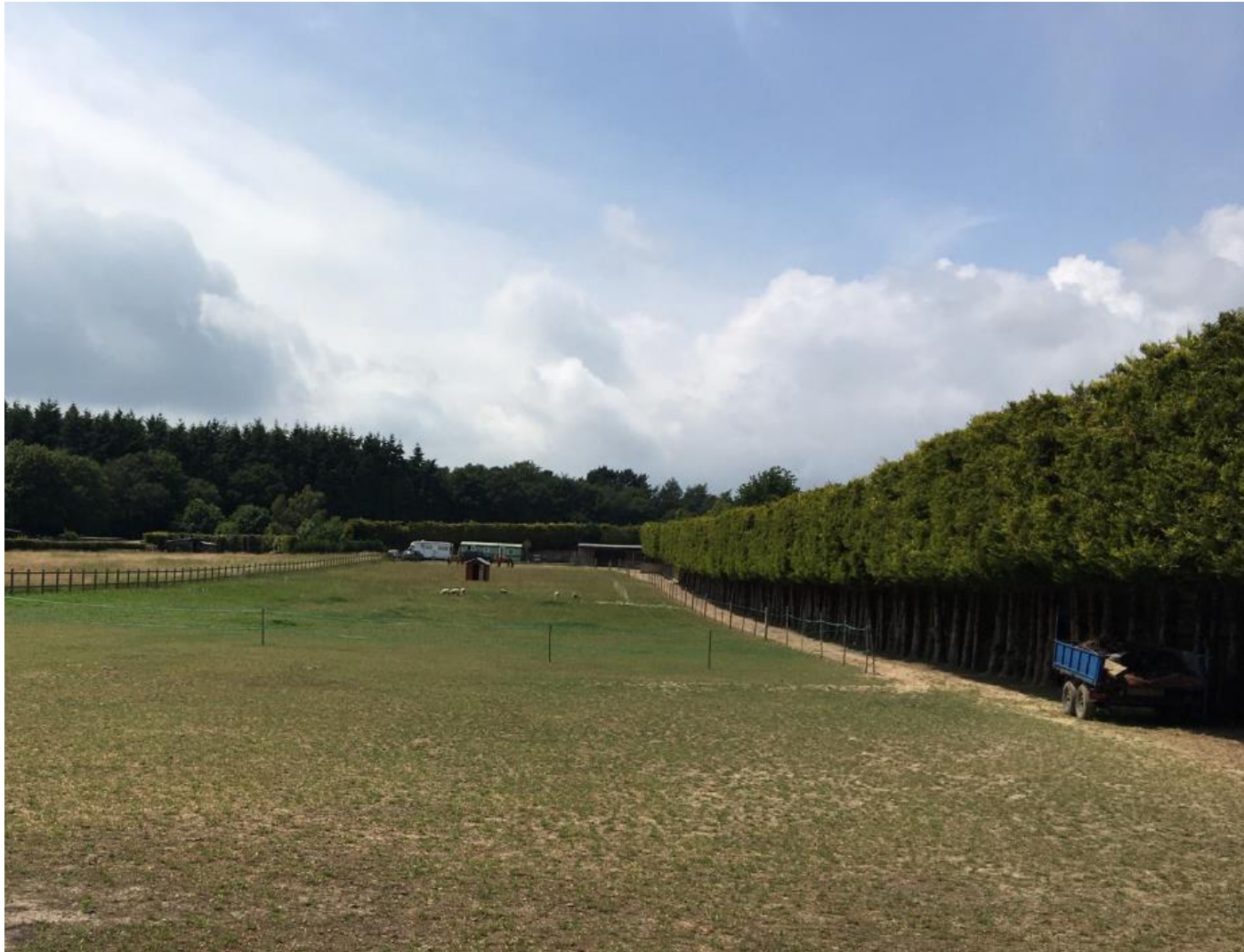
Photo from within the site looking west